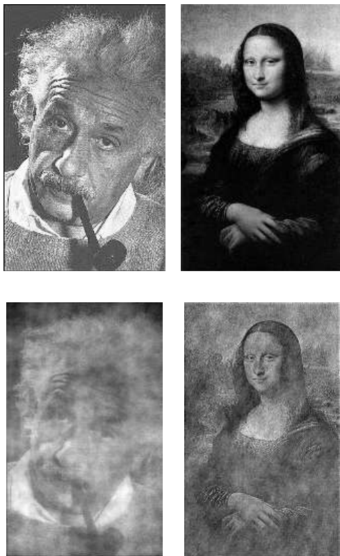
Figure 2: Top, original images. Bottom left, Einstein phases and Mona Lisa amplitudes; bottom right, Einstein amplitudes and Mona Lisa phases.

The same thing works in one dimension. Classical music can be recovered quite recognizably, using its phases and the amplitudes from the rock music. So while it may be true that the hierarchical structure of music and speech leads to a power-law spectrum, in fact this encodes rather little of their distinctive nature. So 1/f spectra may be universal because they express such a general feature that it is not actually very interesting.